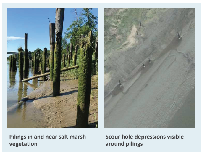
Pilings in and near salt marsh vegetation