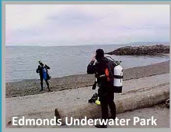
Edmonds Underwater Park