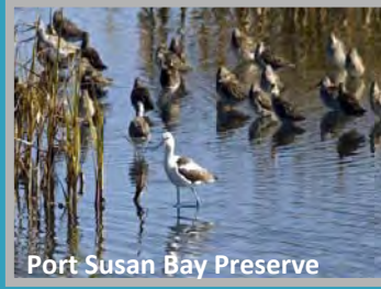
Port Susan Bay Preserve